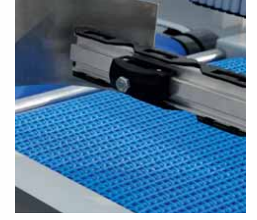
Easy access with opening windows- Intralox belt. doors.