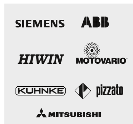
Iso certificated high quality components.