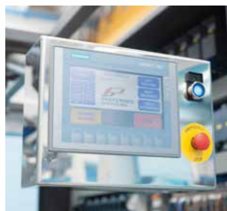
Siemens touch screen with different programs for easy set up.