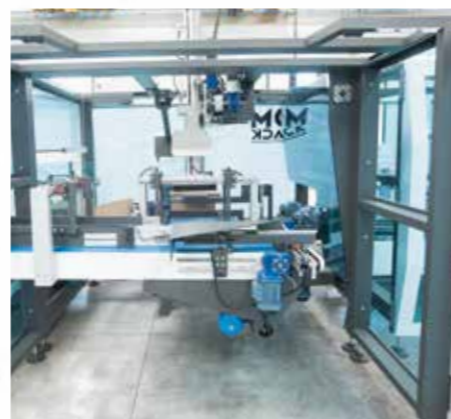
Completely accessible and openable. Loading and cartoning stations are separable to allow operator entering for easy maintenance.