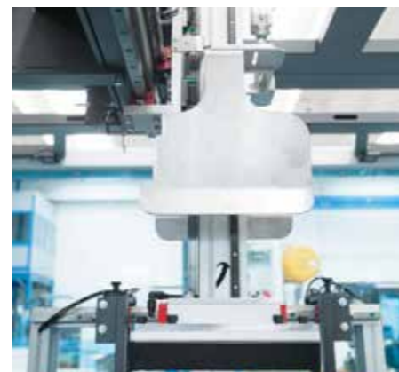
Pick and place for fast & accurate products picking up from the in feed transport conveyor and precise feeding of the carton with the configuration previously set.