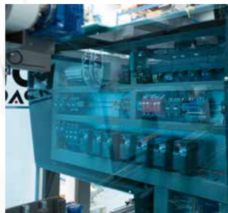
Electric cabinet on view for an immediate diagnosis.