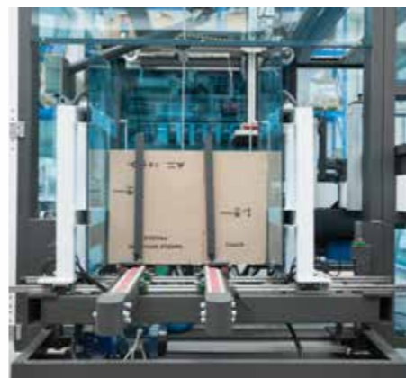
Simple cartons feeding. Reduced machine size. Perfect operability for the operator.