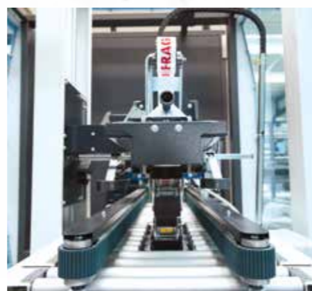
Out feed station with motorised driven belts adjustable for different carton sizes.