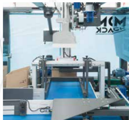
New generation case packer machine, unique. Compact, automatic, simple in the change of format and adjustments (all motorized).