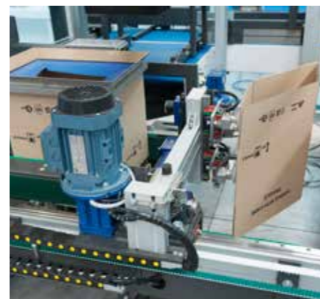
Compact case opening inline or positive 90°.